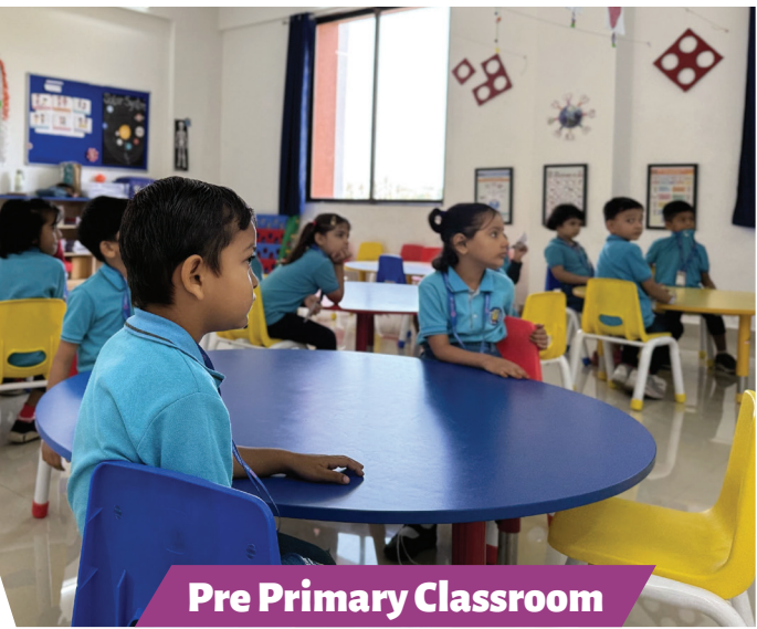
Pre Primary Classroom