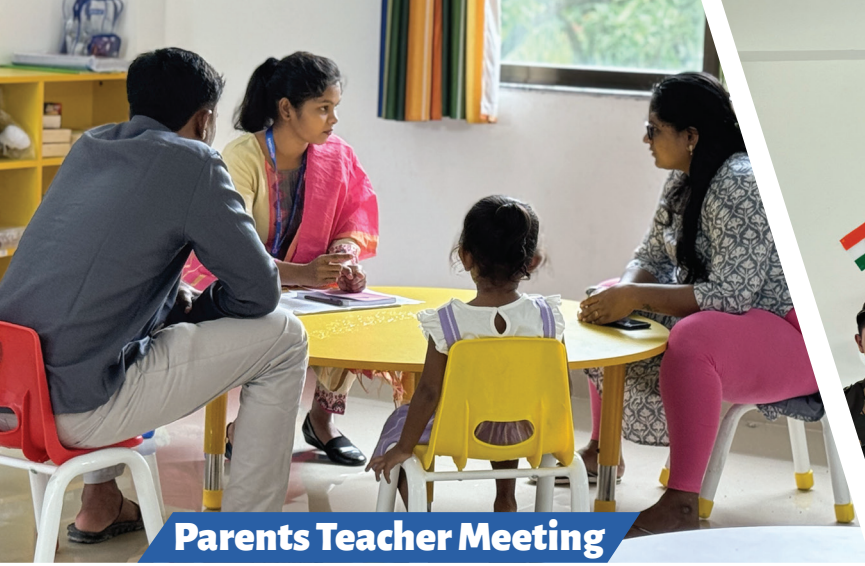
Parents Teacher Meeting